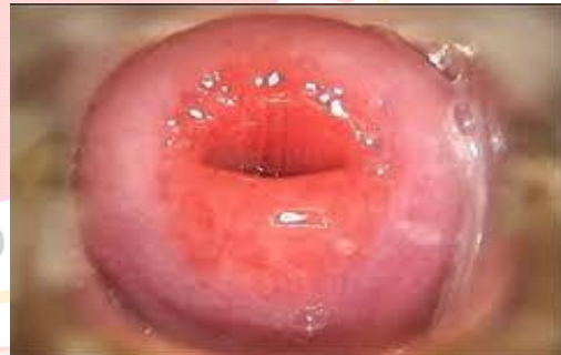
2 nd visit after 15 days: