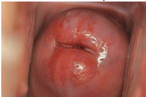
3 rd visit after 30 days: