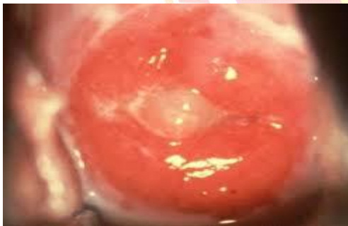
Before treatment (1 st visit)